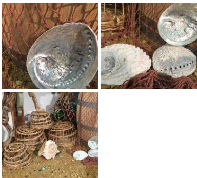
Mother of Pearl Sea Shell, Approx. 15 - 19 cm tall Large natural shell.