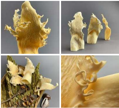
Kelp Seaweed Pieces x 5, white, approx. 10-13cm spread, natural, dried floral deco Kelps are large brown algae seaweeds.