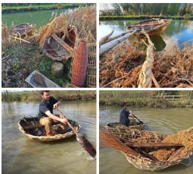
Medieval River Settlement – 2 x Coracles, 2 x Fish Traps, 1 x Eel Trap, Rustic Net and Rush Rope Hank - RENTAL ONLY Week One Rental -