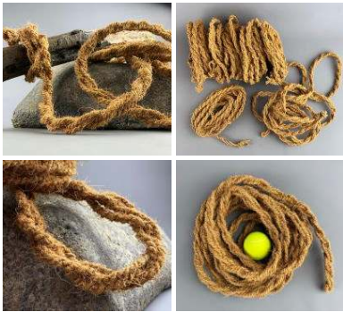
Coir Plaited Twine approx. 5m long by 2 cm Diameter. Natural twine