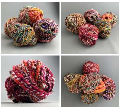
Cotton Rolls, Various Colours