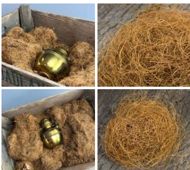
Coir Fibre/Coconut Hair x 1 kg, traditional, natural packing material, used for shipping containers to saddle construction

Coir Fibres (Coconut hair) This fine mixed ginger coconut fibre (Coir) is supplied in 1kg bags.