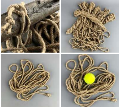
Jute Rope Hank, Approx. 10 m long, 5 mm Diameter Natural Rope